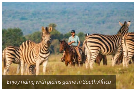
Enjoy riding with plains game in South Africa