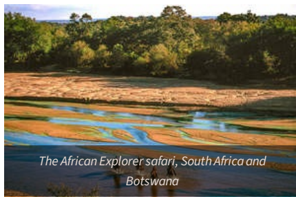
The African Explorer safari, South Africa and Botswana