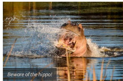
Beware of the hippo!