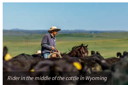
Rider in the middle of the cattle in Wyoming