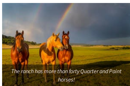
The ranch has more than forty Quarter and Paint horses!