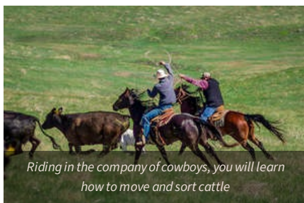
Riding in the company of cowboys, you will learn how to move and sort cattle