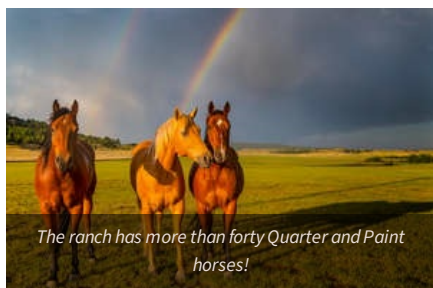
The ranch has more than forty Quarter and Paint horses!