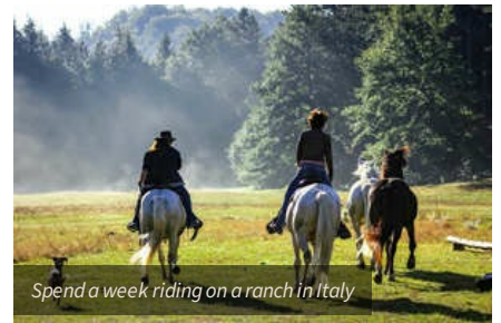
Spend a week riding on a ranch in Italy