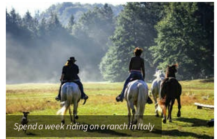
Spend a week riding on a ranch in Italy