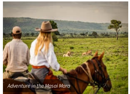
Adventure in the Masai Mara