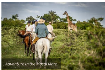
Adventure in the Masai Mara