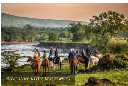
Adventure in the Masai Mara