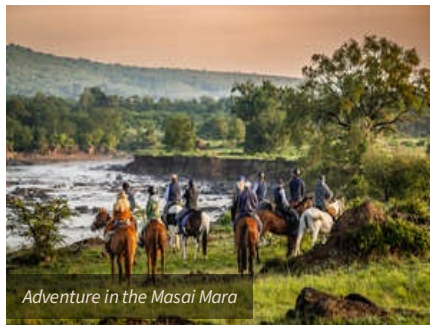
Adventure in the Masai Mara