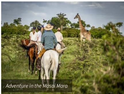
Adventure in the Masai Mara