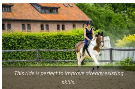
This ride is perfect to improve already existing skills.