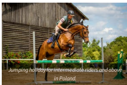
Jumping holiday for intermediate riders and above in Poland.