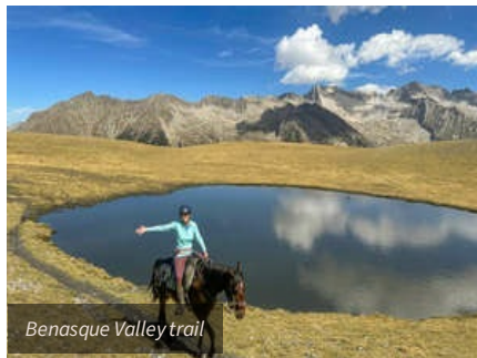
Benasque Valley trail