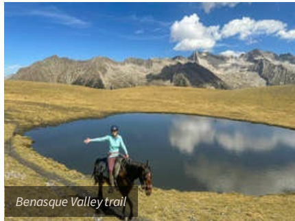
Benasque Valley trail