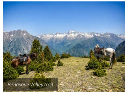
Benasque Valley trail