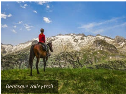
Benasque Valley trail