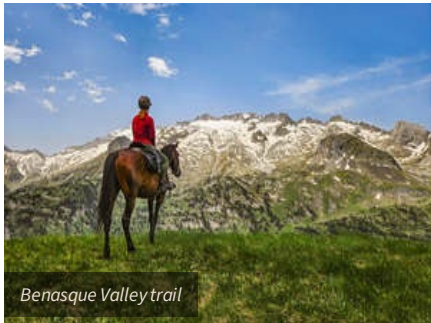
Benasque Valley trail