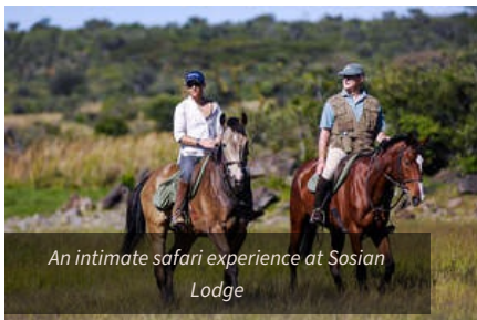
An intimate safari experience at Sosian Lodge