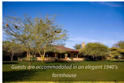
Guests are accommodated in an elegant 1940's farmhouse