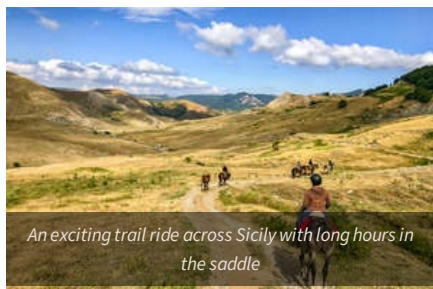
An exciting trail ride across Sicily with long hours in the saddle