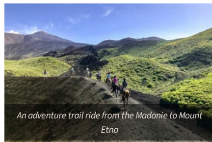
An adventure trail ride from the Madonie to Mount Etna