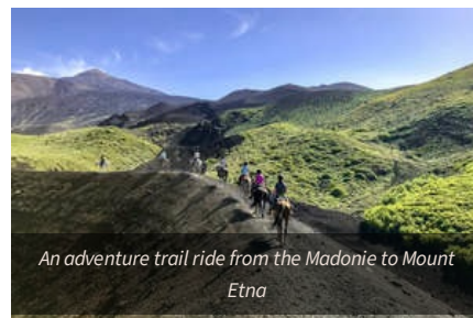
An adventure trail ride from the Madonie to Mount Etna