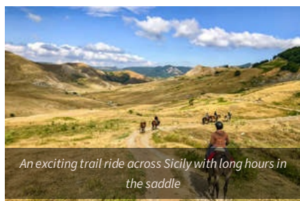
An exciting trail ride across Sicily with long hours in the saddle