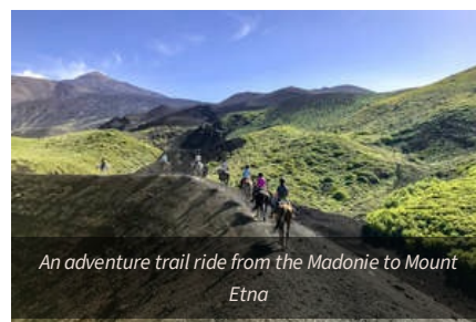
An adventure trail ride from the Madonie to Mount Etna