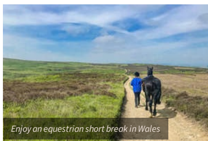
Enjoy an equestrian short break in Wales