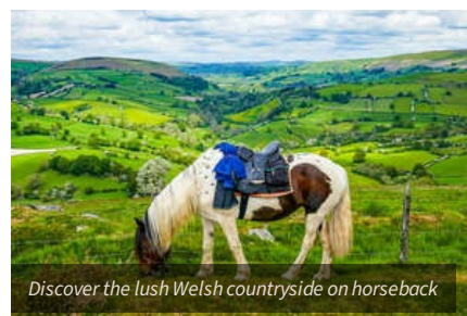
Discover the lush Welsh countryside on horseback