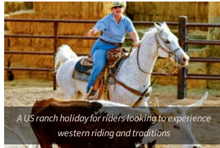
A US ranch holiday for riders looking to experience western riding and traditions