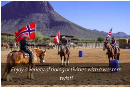
Enjoy a variety of riding activities with a western twist!