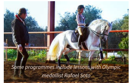
Some programmes include lessons with Olympic medallist Rafael Soto