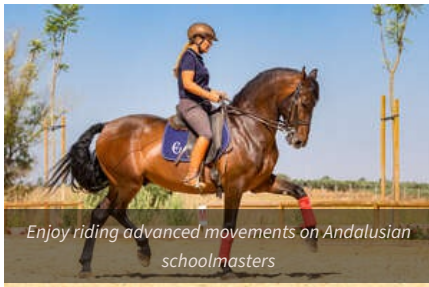
Enjoy riding advanced movements on Andalusian schoolmasters