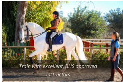
Train with excellent, BHS approved instructors