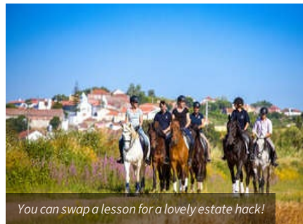
You can swap a lesson for a lovely estate hack!