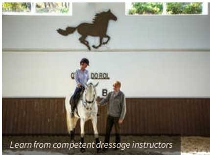
Learn from competent dressage instructors