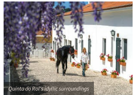
Quinta do Rol's idyllic surroundings