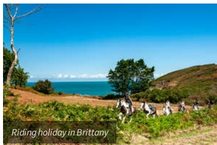
Riding holiday in Brittany