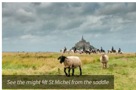
See the might Mt St Michel from the saddle