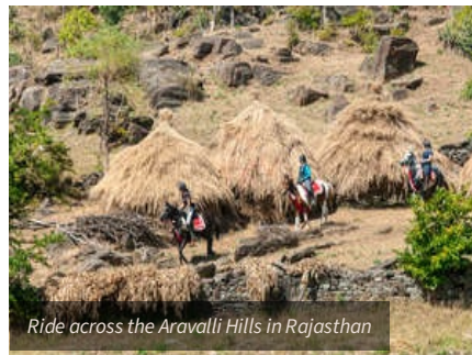
Ride across the Aravalli Hills in Rajasthan