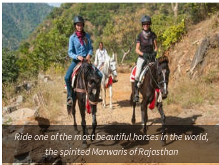
Ride one of the most beautiful horses in the world, the spirited Marwaris of Rajasthan