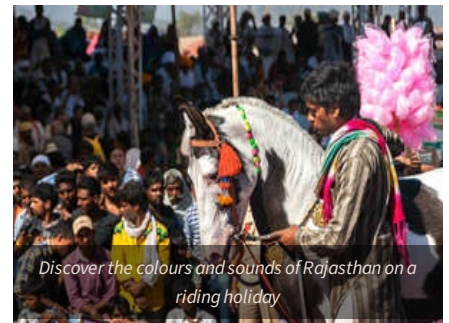
Discover the colours and sounds of Rajasthan on a riding holiday