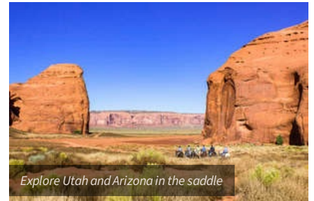
Explore Utah and Arizona in the saddle