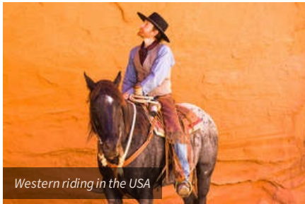
Western riding in the USA