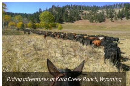
Riding adventures at Kara Creek Ranch, Wyoming