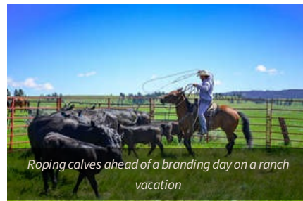
Roping calves ahead of a branding day on a ranch vacation