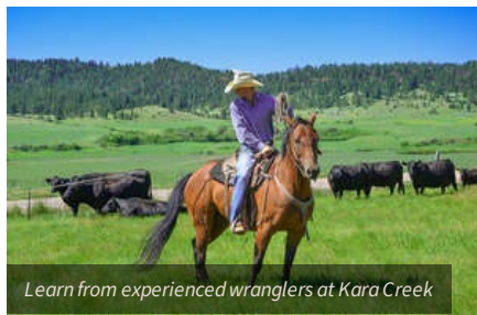
Learn from experienced wranglers at Kara Creek