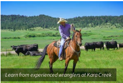
Learn from experienced wranglers at Kara Creek