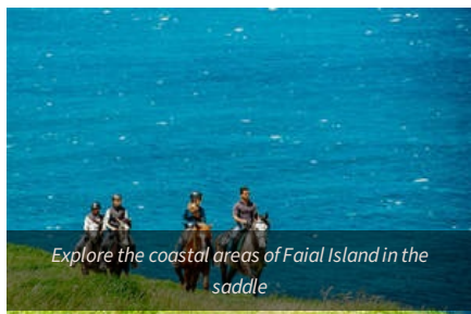
Explore the coastal areas of Faial Island in the saddle