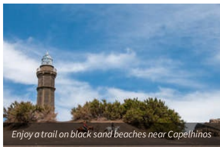
Enjoy a trail on black sand beaches near Capelinhos