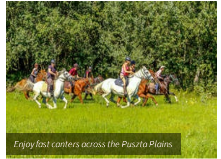
Enjoy fast canters across the Puszta Plains