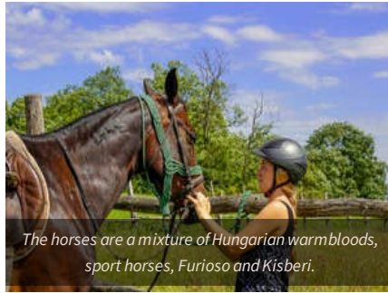
The horses are a mixture of Hungarian warmbloods, sport horses, Furioso and Kisber.