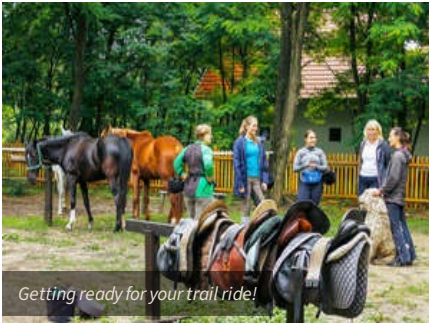
Getting ready for your trail ride!