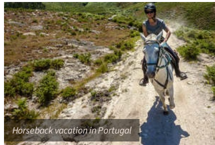
Horseback vacation in Portugal