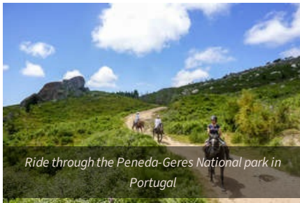
Ride through the Peneda-Geres National park in Portugal