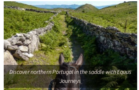
Discover northern Portugal in the saddle with Equus Journeys