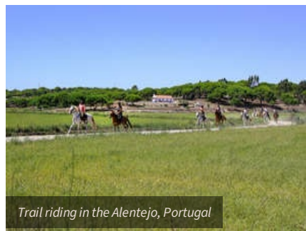
Trail riding in the Alentejo, Portugal