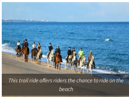
This trail ride offers riders the chance to ride on the beach