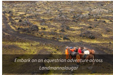
Embark on an equestrian adventure across Landmannalaugar