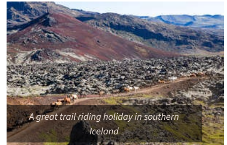
A great trail riding holiday in southern Iceland