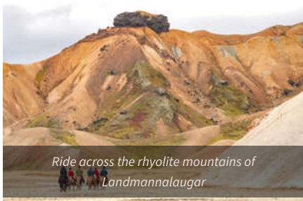
Ride across the rhyolite mountains of Landmannalaugar