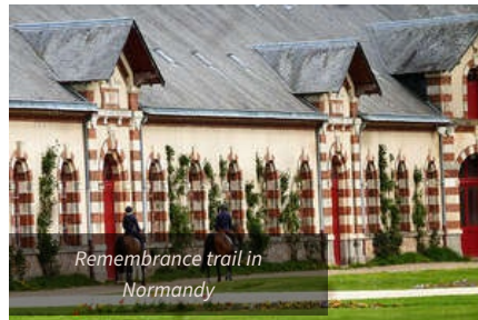
Remembrance trail in Normandy