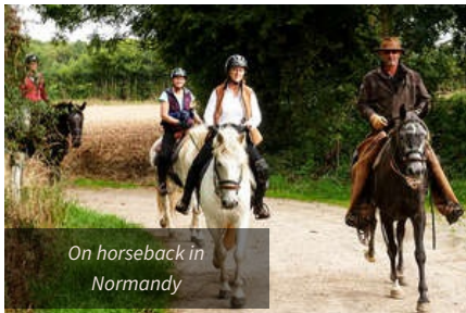
On horseback in Normandy