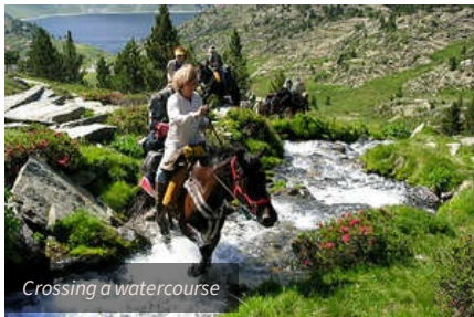
Crossing a watercourse