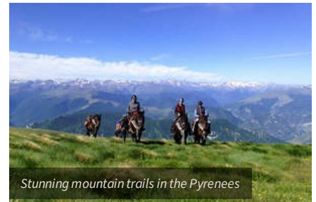
Stunning mountain trails in the Pyrenees