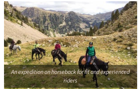
An expedition on horseback for fit and experienced riders