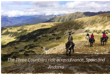
The Three Countries ride across France, Spain and Andorra