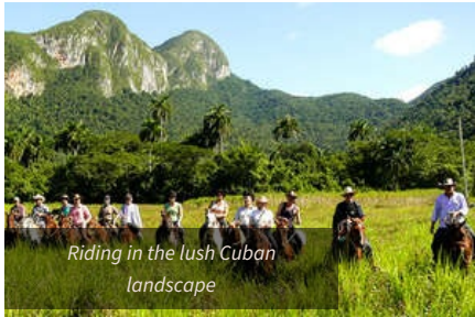
Riding in the lush Cuban landscape