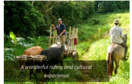
A wonderful riding and cultural experience