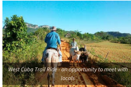
West Cuba Trail Ride - an opportunity to meet with locals