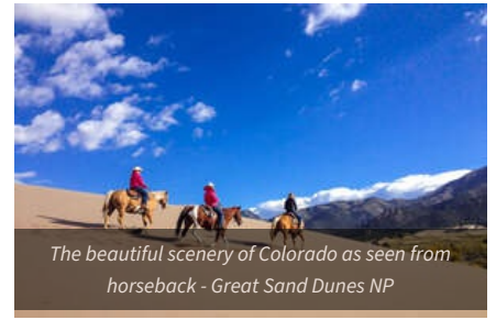
The beautiful scenery of Colorado as seen from horseback - Great Sand Dunes NP