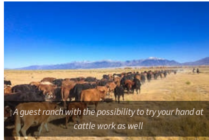
A guest ranch with the possibility to try your hand at cattle work as well