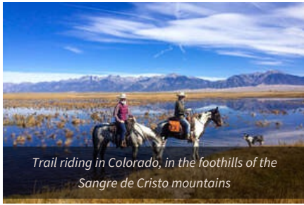
Trail riding in Colorado, in the foothills of the Sangre de Cristo mountains