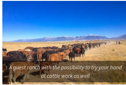
A guest ranch with the possibility to try your hand at cattle work as well