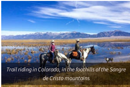
Trail riding in Colorado, in the foothills of the Sangre de Cristo mountains