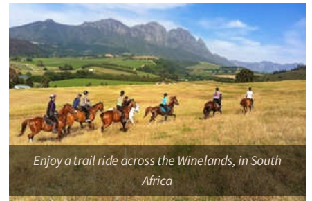
Enjoy a trail ride across the Winelands, in South Africa