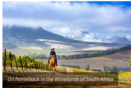
On horseback in the Winelands of South Africa