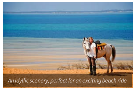
An idyllic scenery, perfect for an exciting beach ride