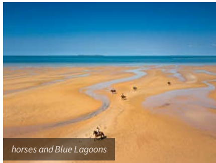
horses and Blue Lagoons