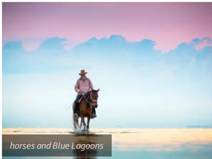
horses and Blue Lagoons