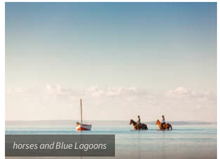
horses and Blue Lagoons