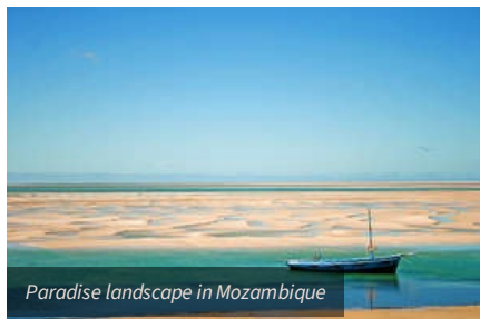
Paradise landscape in Mozambique