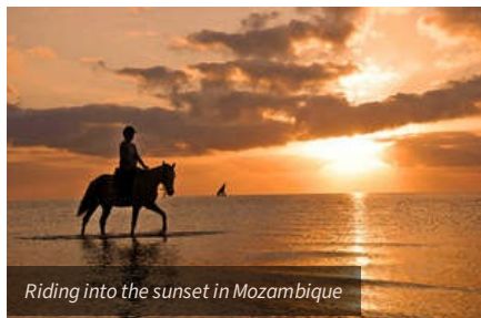
Riding into the sunset in Mozambique