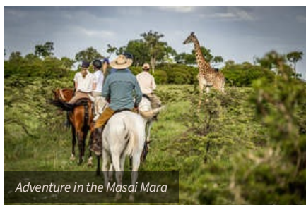
Adventure in the Masai Mara