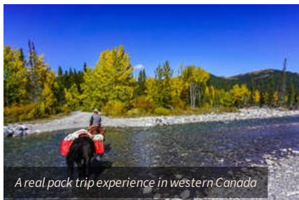
A real pack trip experience in western Canada