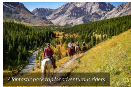
A fantastic pack trip for adventurous riders