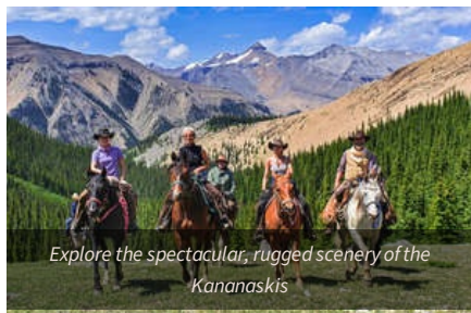
Explore the spectacular, rugged scenery of the Kananaskis