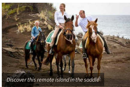
Discover this remote island in the saddle