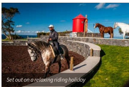
Set out on a relaxing riding holiday