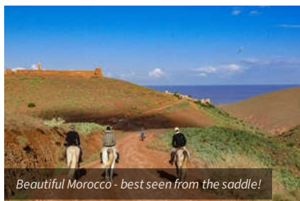
Beautiful Morocco - best seen from the saddle!