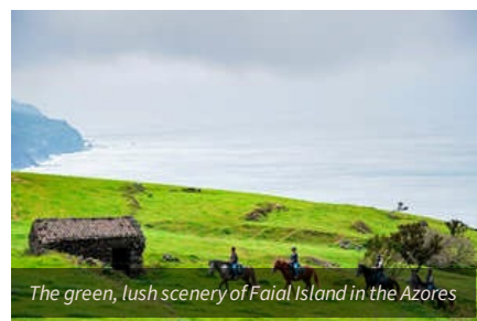
The green, lush scenery of Faial Island in the Azores