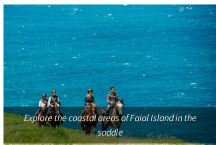
Explore the coastal areas of Faial Island in the saddle