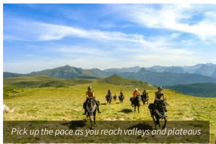
Pick up the pace as you reach valleys and plateaus