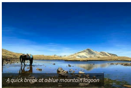
A quick break at a blue mountain lagoon