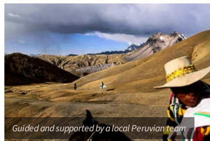
Guided and supported by a local Peruvian team