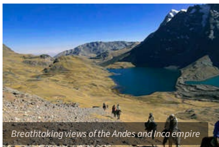
Breathtaking views of the Andes and Inca empire