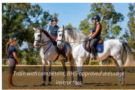
Train with competent, BHS-approved dressage instructors