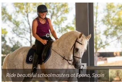
Ride beautiful schoolmasters at Epona, Spain