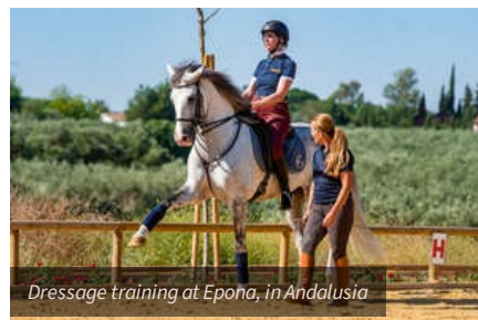
Dressage training at Epona, in Andalusia