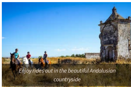
Enjoy rides out in the beautiful Andalusian countryside