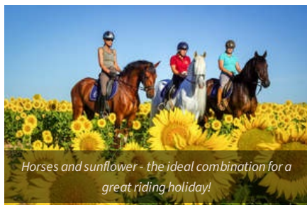
Horses and sunflower - the ideal combination for a great riding holiday!