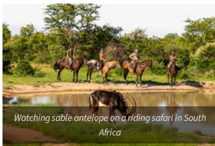
Watching sable antelope on a riding safari in South Africa