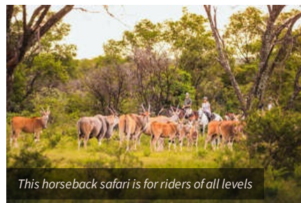
This horseback safari is for riders of all levels